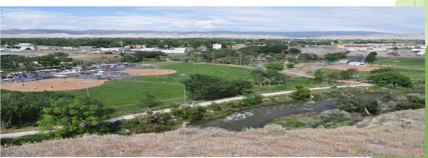
View of Ute & McNeil Fields from above the river