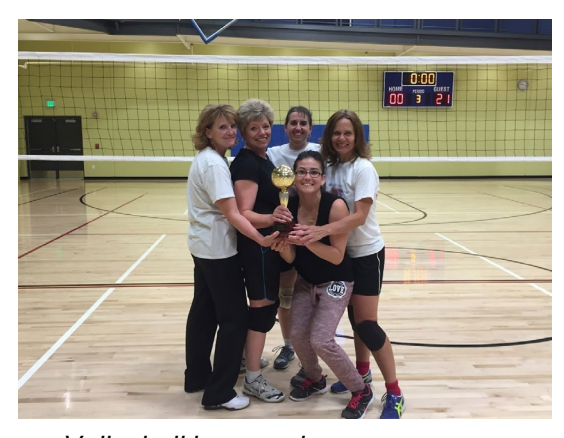
Volleyball league champs