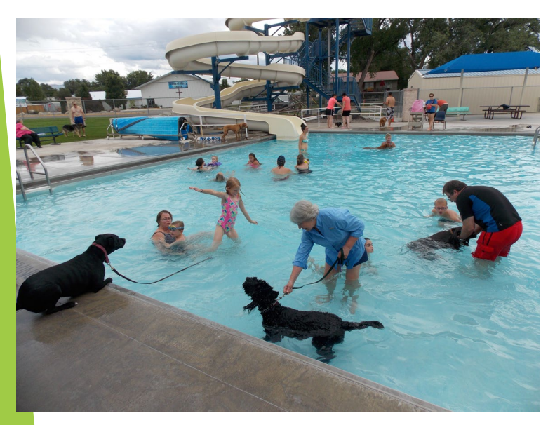
The Dog Days of Summer at the outdoor pool