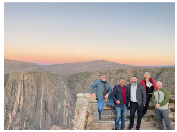
PROS Consulting project team and MRD staff at the rim of the Black Canyon National Park