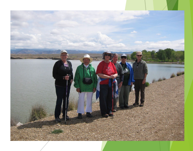
Participants in the 50+ Program on an outing