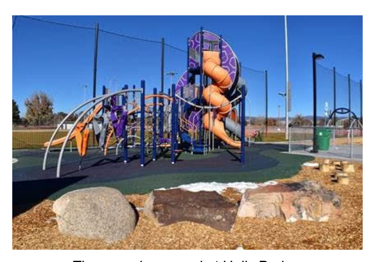
The new playground at Holly Park