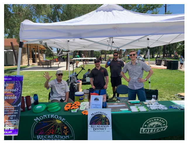
Board and staff celebrate and gather public input with Colorado Lottery official at FUNC Fest 2021