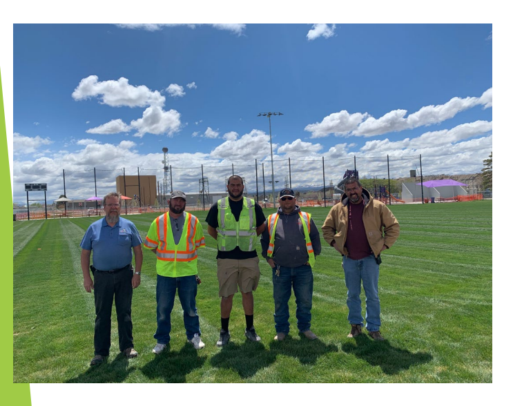
Parks Maintenance team at Holly Park